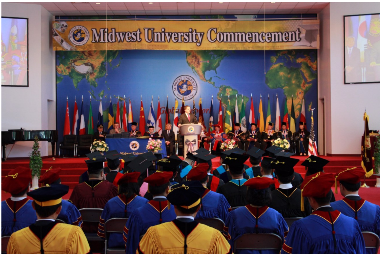
Dr. John R. Ashcroft Missouri Secretary of State

Placement Rate: Undergraduate and Graduate: 100%