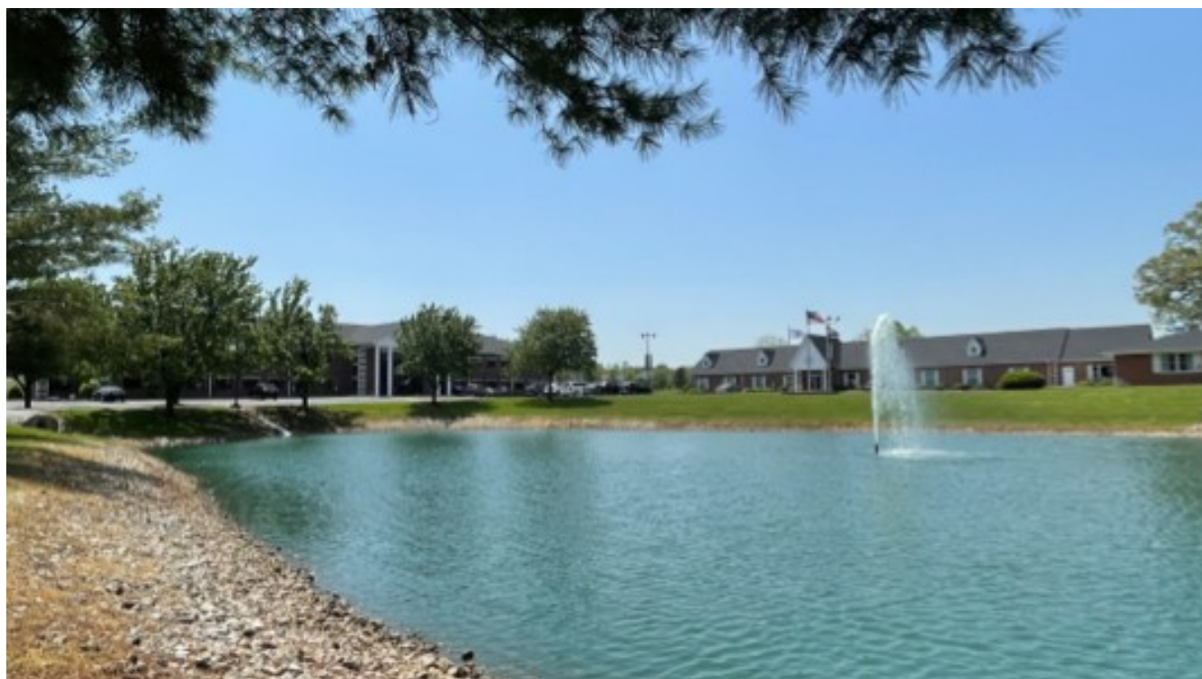
Midwest University Campus in Wentzville, MO