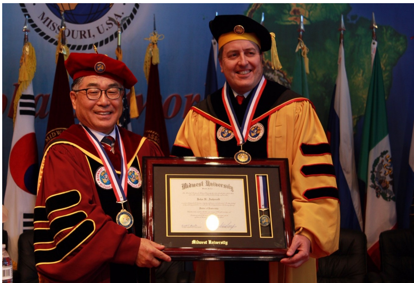
Dr. John R. Ashcroft Honorary Doctor of Leadership Missouri Secretary of State