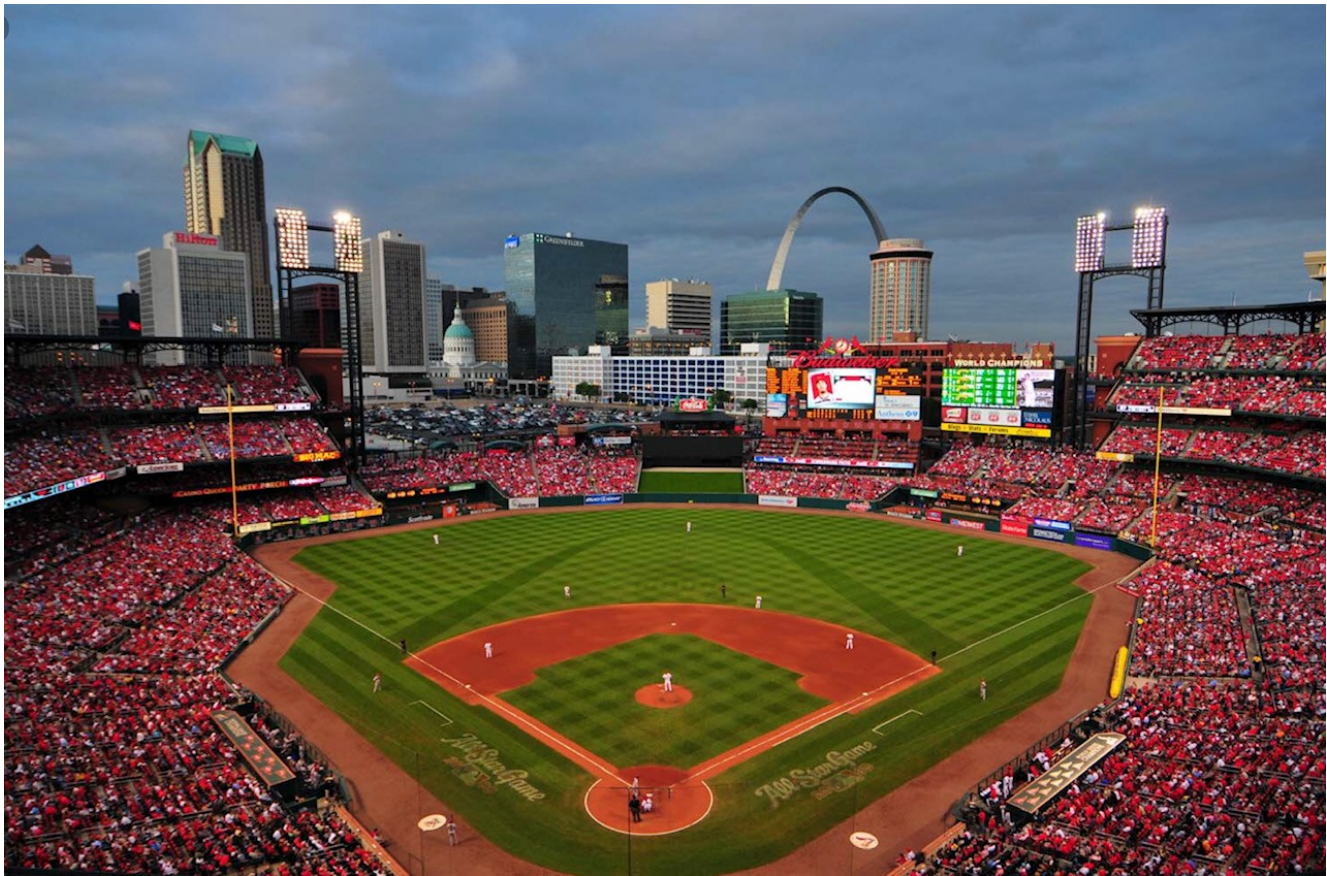
St. Louis Cardinals Stadium

Midwest University complies with Section 504 of the Rehabilitation Act of 1973, which states: “No otherwise qualified handicapped individual in the United States shall solely, by reason of his handicap, be excluded from participation in, be denied the benefits of, or be subjected to discrimination under any program or activity receiving federal financial assistance.” A physically challenged person needing additional help should contact the Director of Student Affairs so that appropriate assistance can be provided. Midwest University does not discriminate on the basis of physical handicap.