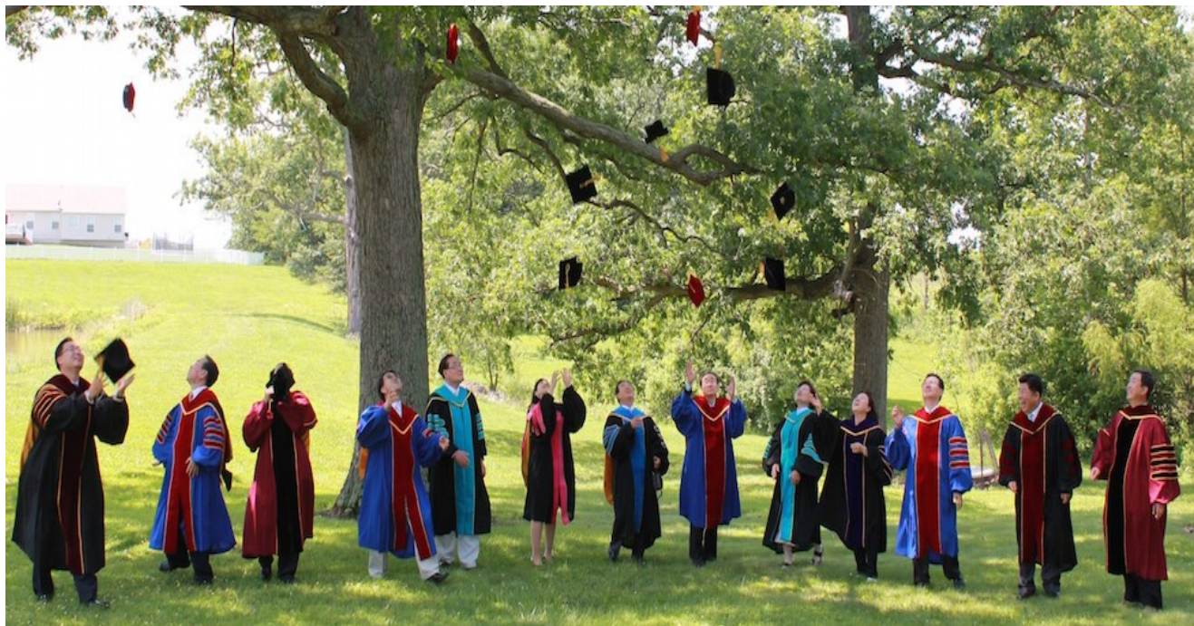
< The grand finale of the Midwest University graduation: tossing the caps into the air>