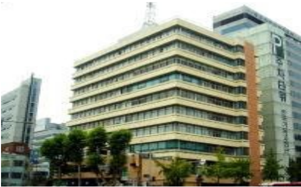
Seoul Office, South Korea