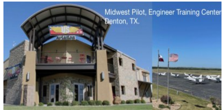
Aviation Dallas, Texas