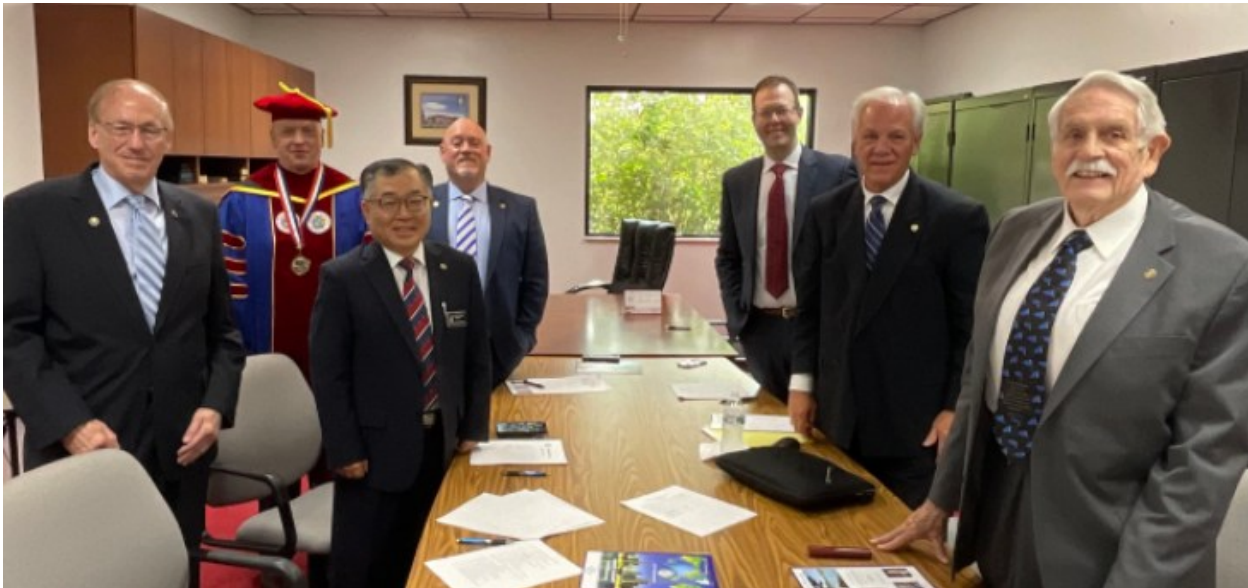
Midwest University Foundation Board of trustees