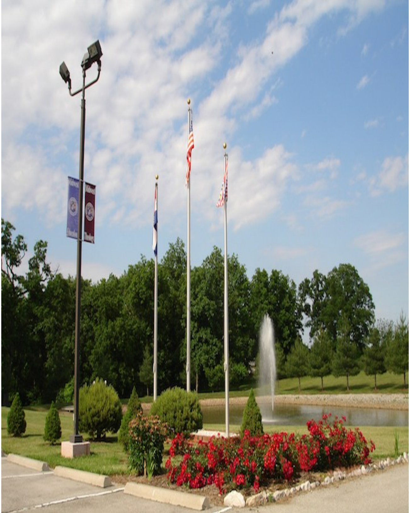
Midwest University Campus in Wentzville, MO