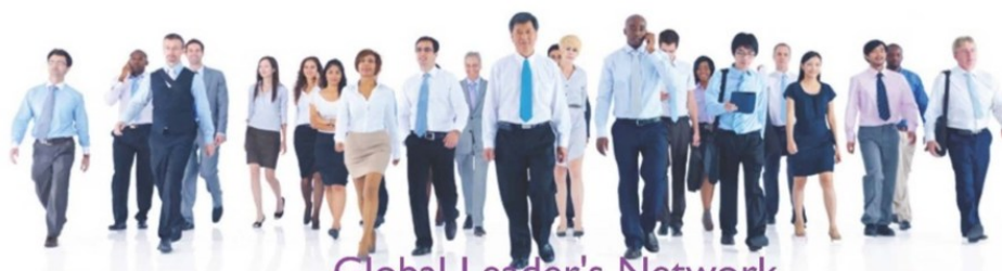
Global Leader's Network