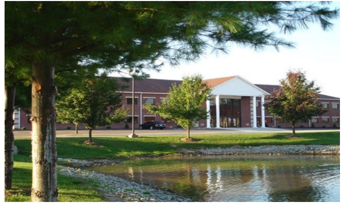
Main Campus Wentzville, Missouri, USA