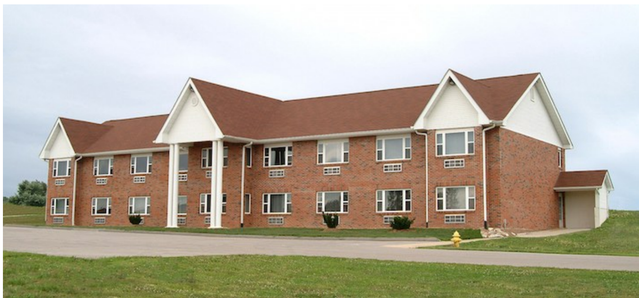
Midwest University Residence Hall