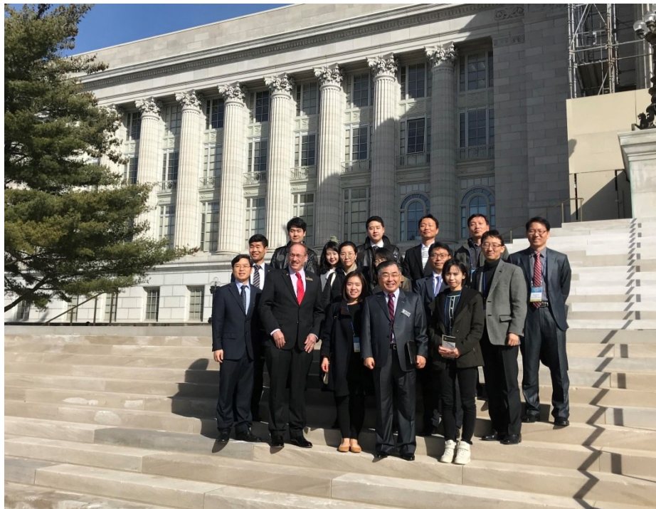
MIRI Research Scholar Missouri State Capital

At the conclusion of their program, participants are expected to return to their home countries. Some categories of the Exchange Visitor Program permit a spouse and/or unmarried children under 21 years of age to accompany an exchange visitor to the United States. These individuals are considered dependents of the J-1 visitor and may apply for J-2 visas with the permission of the sponsor, Midwest University. The program is identified as Exchange Visitor Program No P-1-21241.