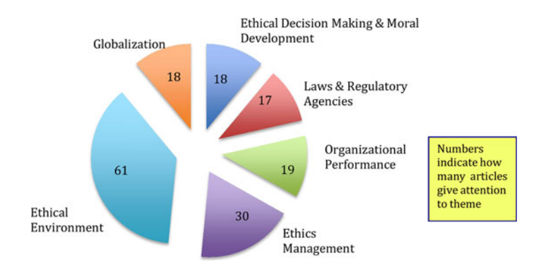
FIGURE 1 Public Integrity/Public Administration Review research themes, 2005–2014.

As noted above, articles published in two peer-reviewed journals owned by the American Society for Public Administration (ASPA), Public Administration Review and Public Integrity , are the primary sources for this review.<sup>2</sup> Both journals seek to publish research that bridges theory and practice, thus targeting both the academic and practitioner communities. Public Administration Review , with a 75-year history, is widely regarded as the journal of record